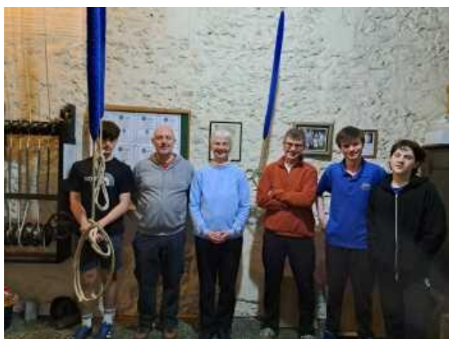
Quarter peal band 10 th April

We have had two outings, one in the Spring to the Cheltenham area for the weekend and in the Autumn, a day visiting the Isle of Sheppy. Both were enjoyed by ourselves and helped by friends.