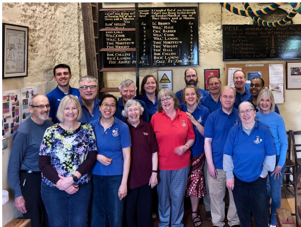
Kingston Ringers on Coronation Day