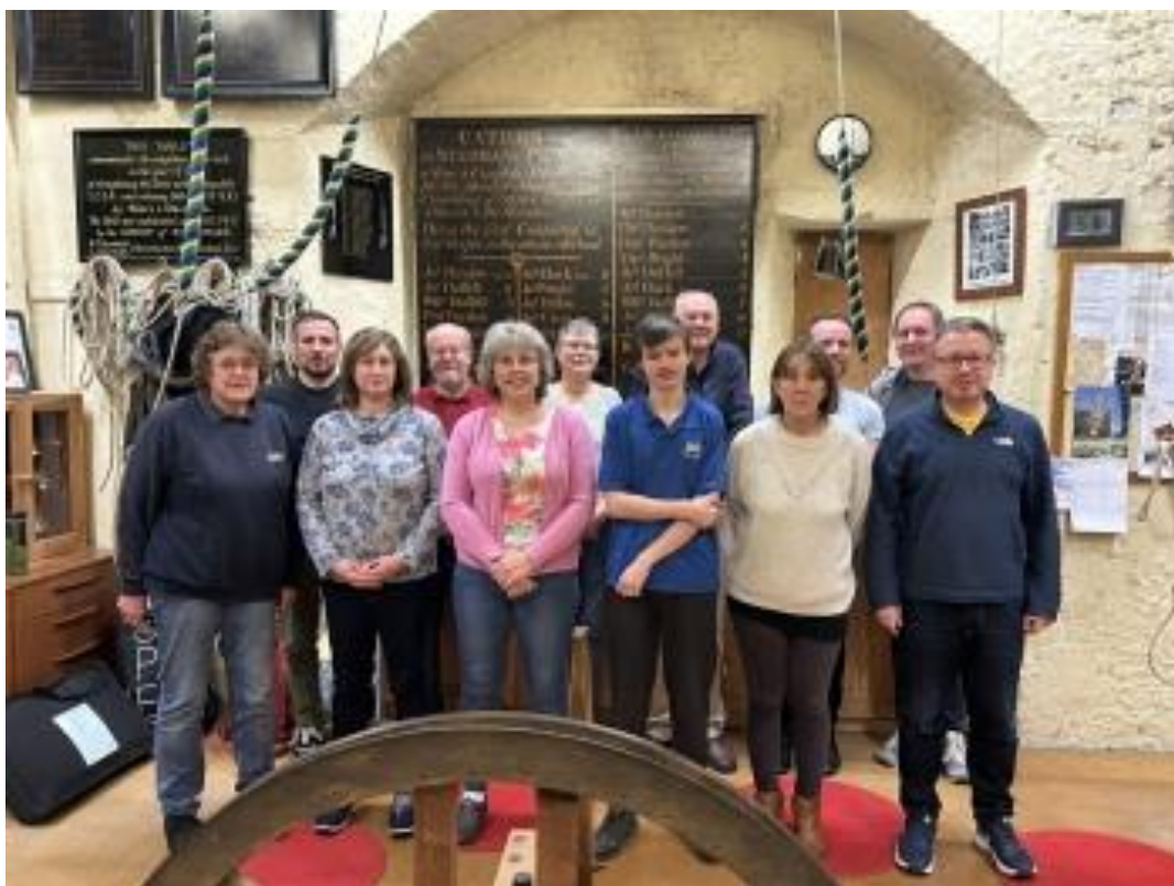
Band in order clockwise from front right