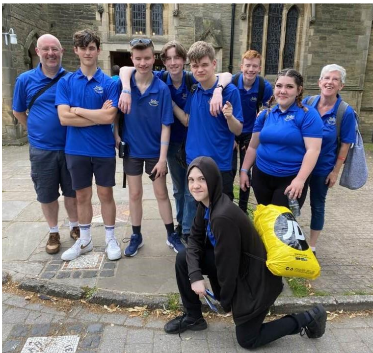
Surrey Strikers RWNYC in York