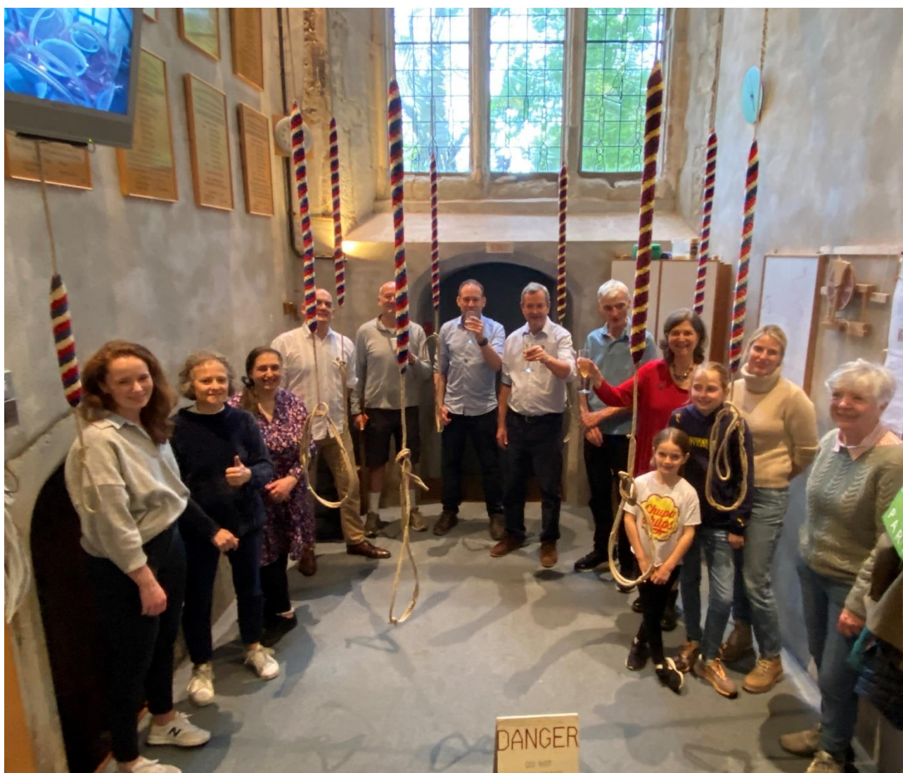
The new ringers who rang for the King at Barnes on Coronation Day

Sunday service ringing has been well attended and, as in 2022, we have been able to ring on every Sunday throughout the year.