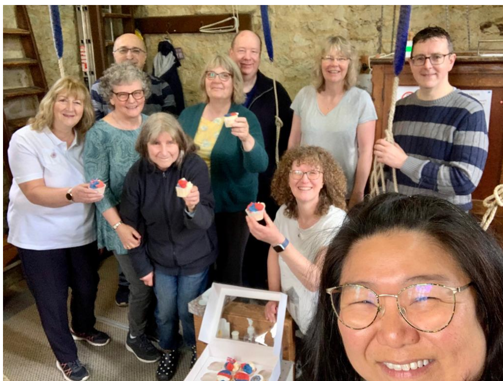
Coronation Cupcakes and Ringers

A huge thank you as always to those who regularly support us.