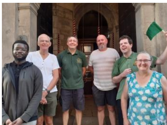
Band in order Lef to Right