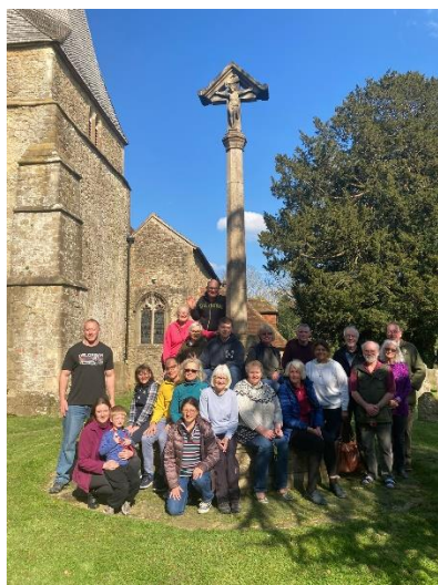
Merstham outing to 5 Kent towers in April

As our learners are now ringing independently we are planning another push for new learners to replace the natural churn as young 'uns come and go.