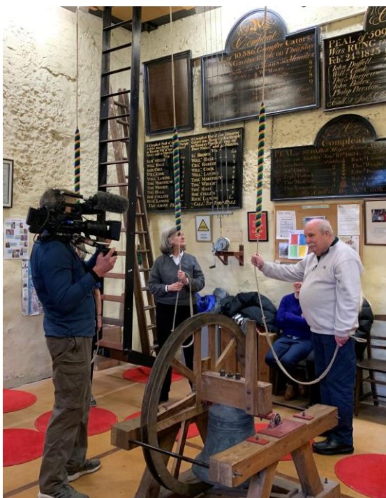
Media coverage of Ring for the King at Kingston